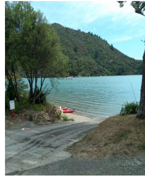
Portage Boat ramp

The Association takes an active interest in facilitating the installation of new community assets. We recently regularised a ski lane in a popular location. We advocated for a recycling facility. We are looking at installing a fit-for-purpose emergency helipad off Kenepuru Road.