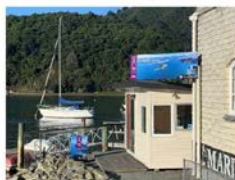
Tuia Hub/Office is next door to Edwin Fox, sponsored by Port Marlborough

Follow us on social @totaranui250 Website: www.totaranui250.co.nz