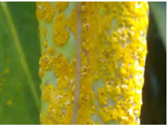
The lesions get bigger and produce masses of bright yellow spores

Your reports of suspected cases are vital in helping determine where myrtle rust is in New Zealand, how far it has spread and whether eradication, containment, or even slowing the spread is feasible.