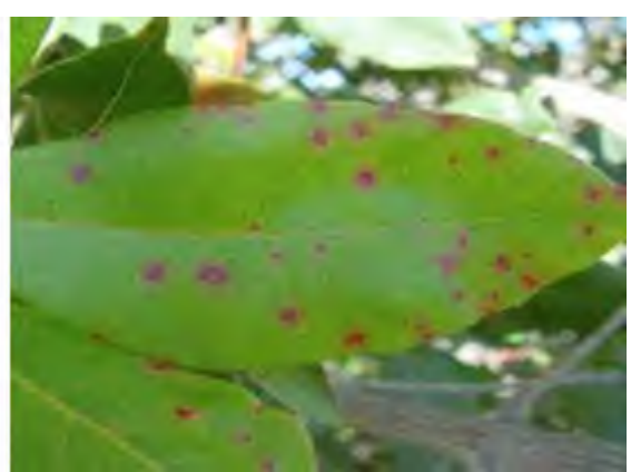
How the disease begins and forms - new yellow pustules and small brown spots