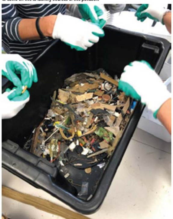
Plastic items make up the majority of the movine I tter found in the Sounds

Varying levels and types of microplastics were found in both areas. There is more work to come on this to identify sources of this pollution.