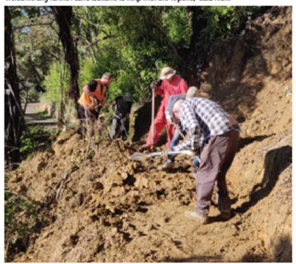
Link Pathway volunteers working on The Grove section of the trail which is now open for us

"The Unix Pathway Trust is extremely grateful for the offers of help, and over 70 donations through the Link Pathway Greatitie page, totaling almost $10,000, and we welcome any further contributions to help with the repairs," said Rick.